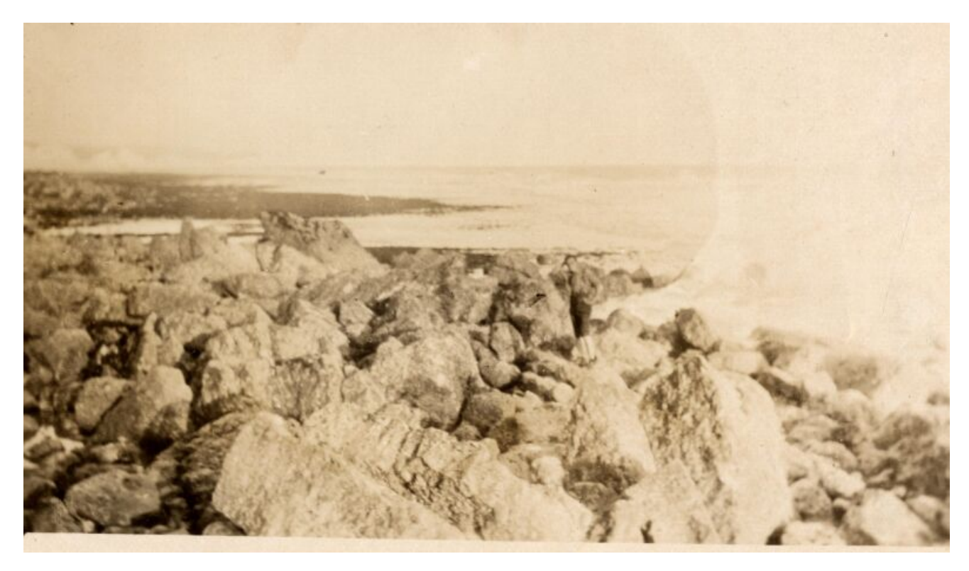
ph 30607: Low tide, Seaford [Sussex, England], 1917.

[The following three prints removed from envelope postmarked 10 Oct. 1917].